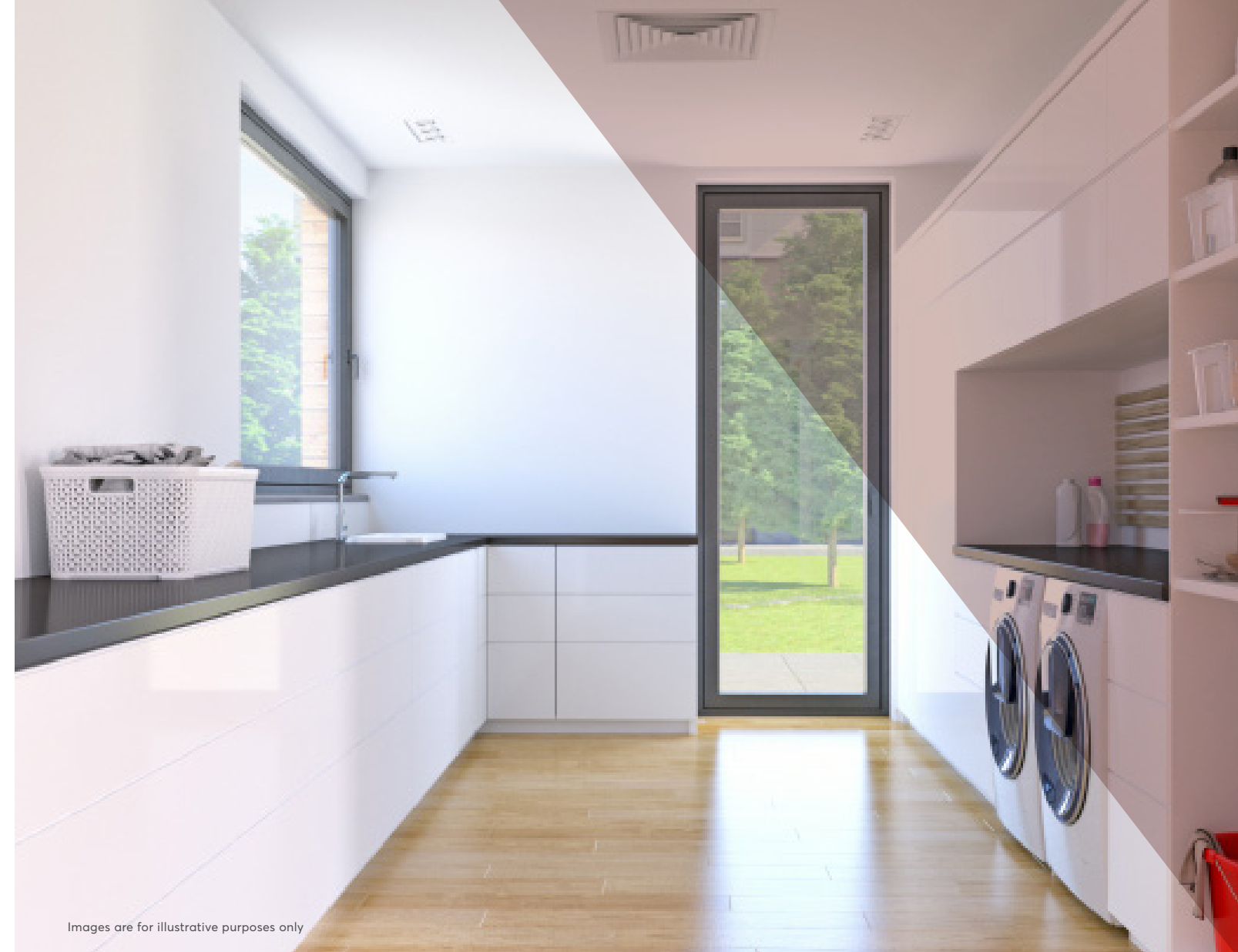
Images are for illustrative purposes only